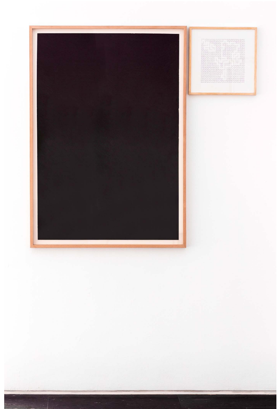
Fuentesal & Arenillas. Why the Animals Travel (Diptych), 2016 Crayon on Schoeller paper. 100 x 70 cm Rotring and pen on paper. 40 x 40 cm