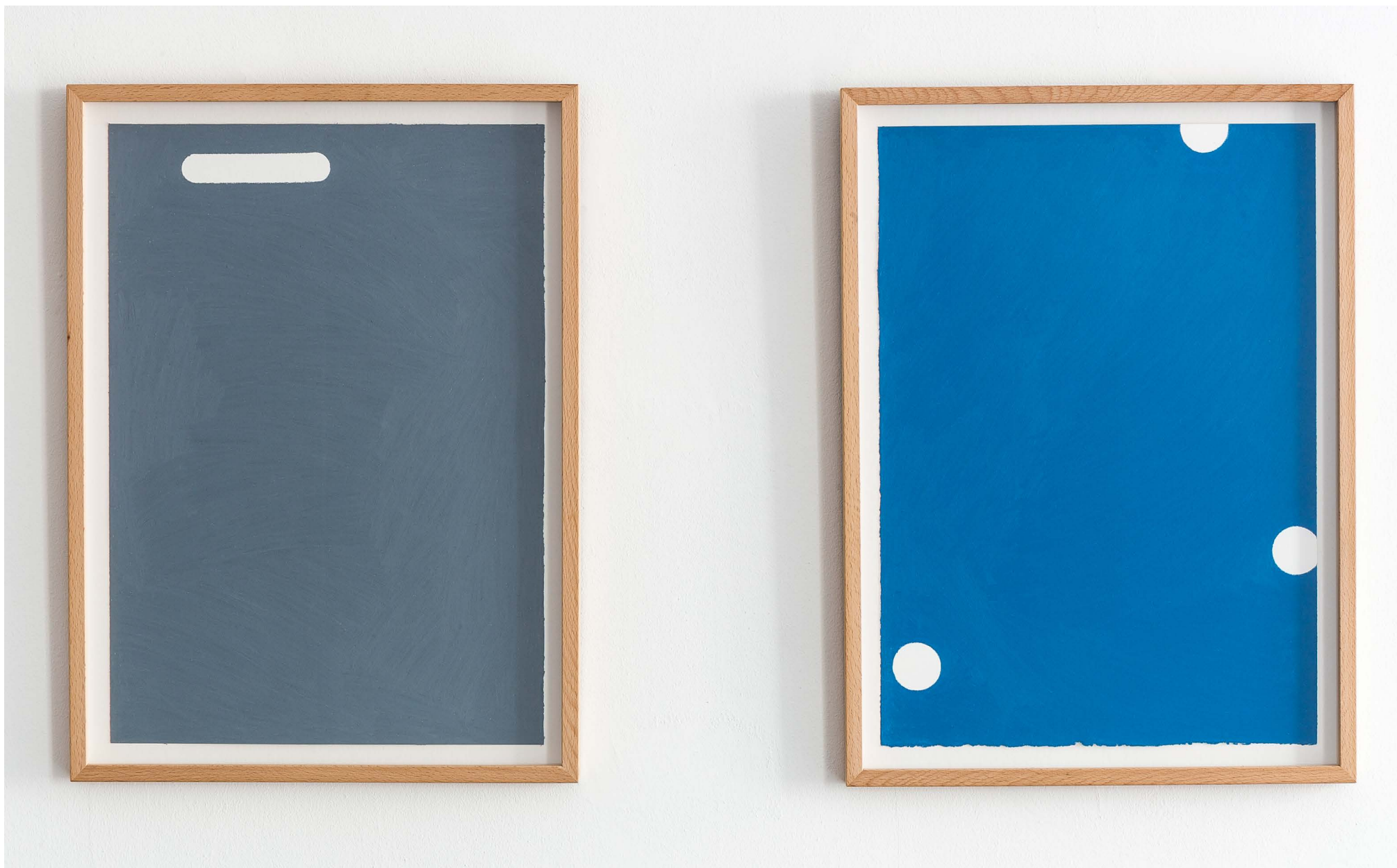
Carpet's Couple 2, 2016 Crayon on Fabriano paper 250 g. 35 x 50 cm / each one