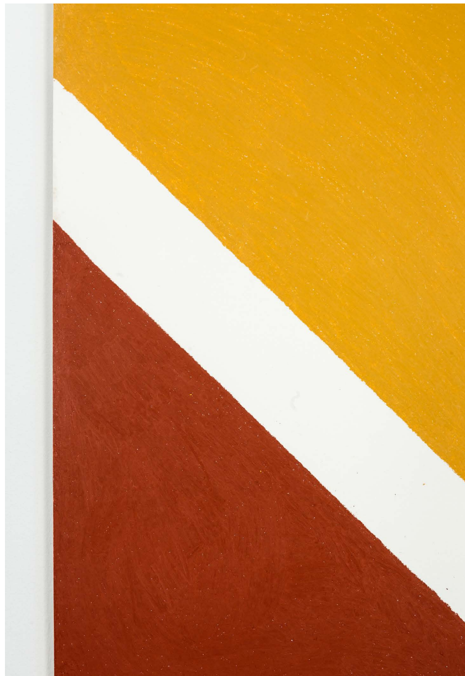
Carpet 2 (Detail) , 2016 Crayon on Cansón paper 300 g. 122 x 150 cm