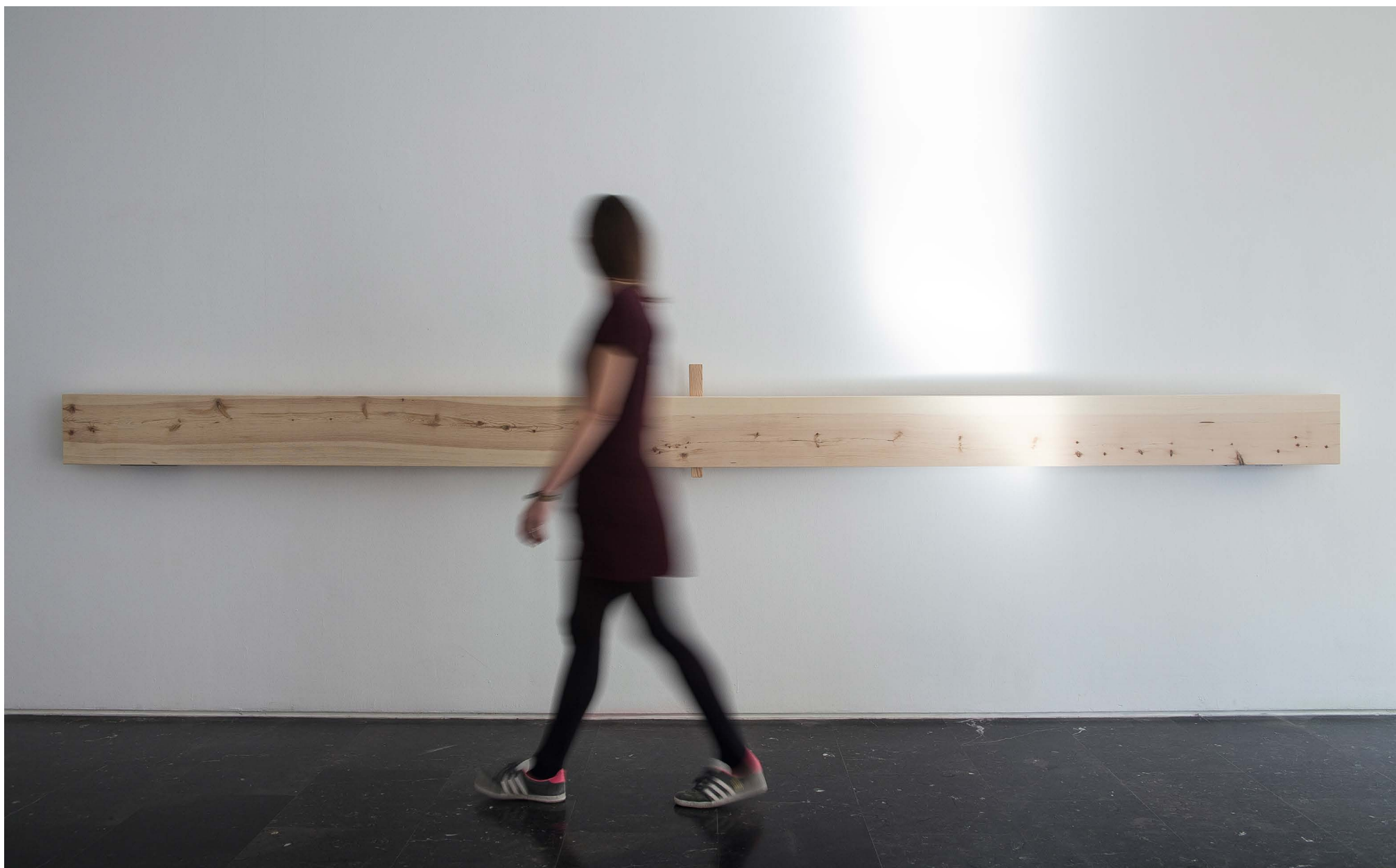
Viga de madera con ensamble , 2016 Pine and iron. 400 x 25 x 7 cm