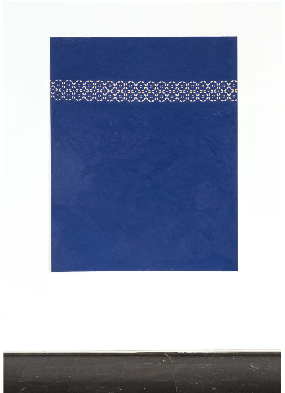
Carpet 1, 2016 Crayon on Cansón paper 300 g. 122 x 150 cm