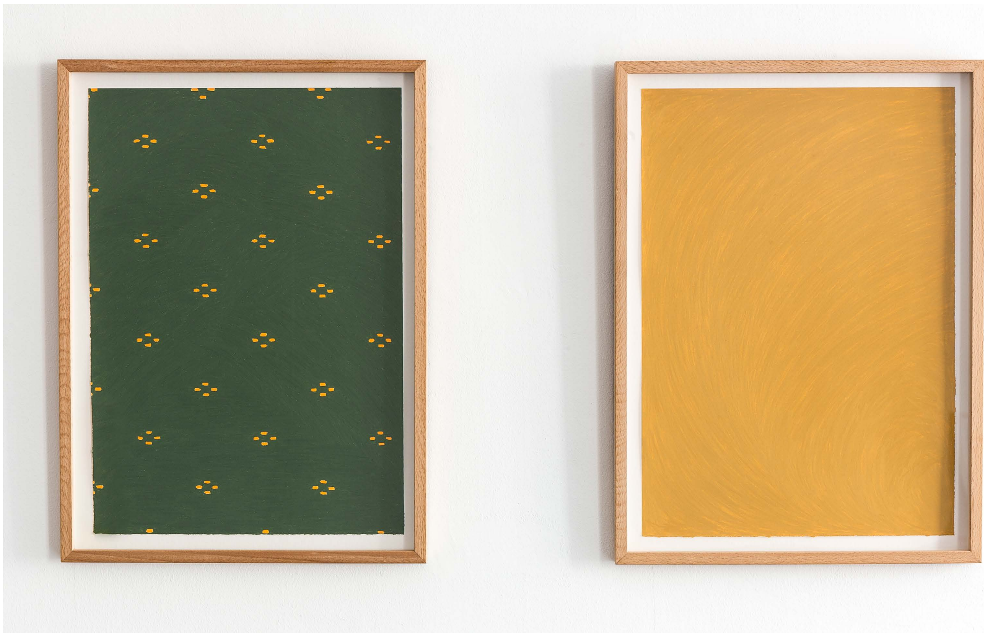
Carpet's Couple 1, 2016 Crayon on Fabriano paper 250 g. 35 x 50 cm / each one