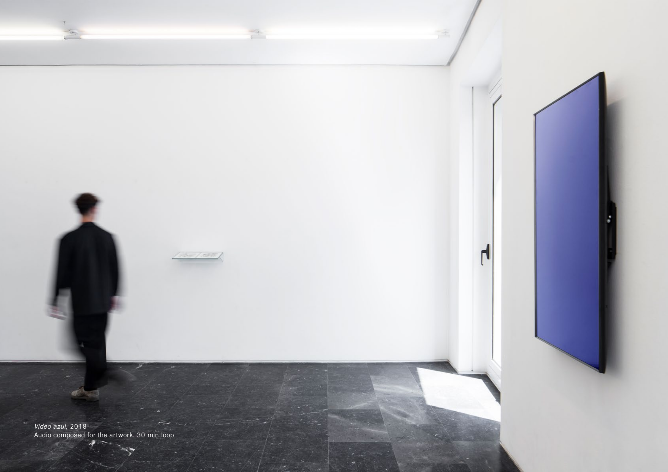
Vídeo azul , 2018 Audio composed for the artwork. 30 min loop