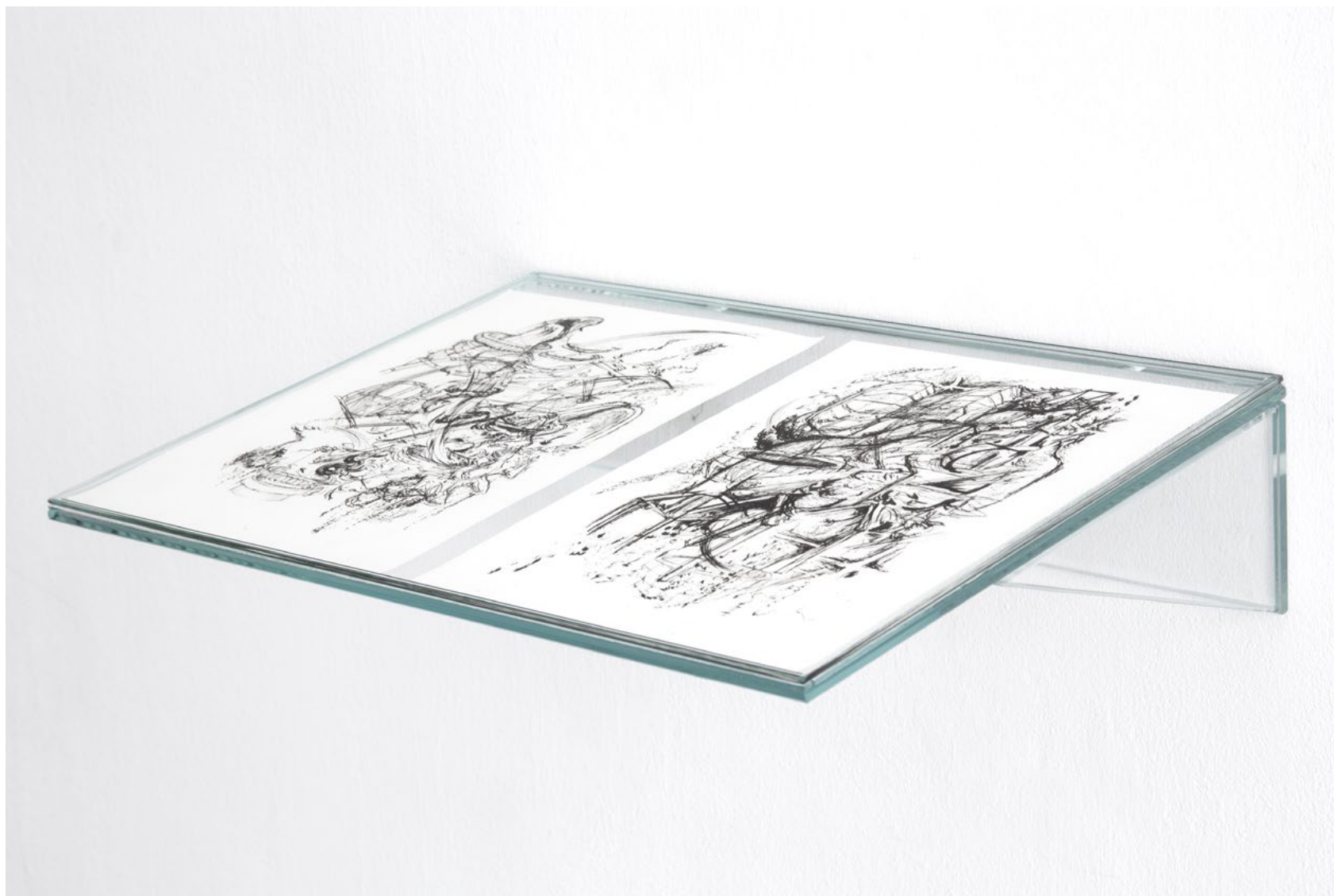
Dos dibujos , 2018. Canson paper 160 g / m 2 . 28.2 x 21 cm with 1.5 mm glass frame 45 x 31 x 8 cm at 70 degrees inclination