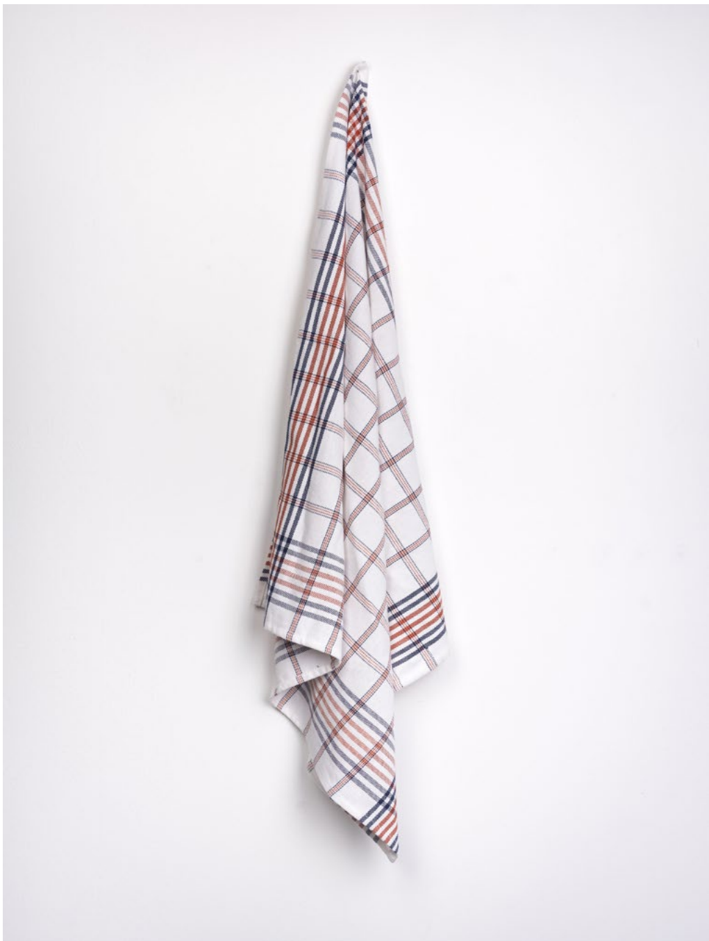
Untitled (Trapo cocina), 2018 Digital print on 310 gr paper. 102 x 75 cm. Ed. 1/3