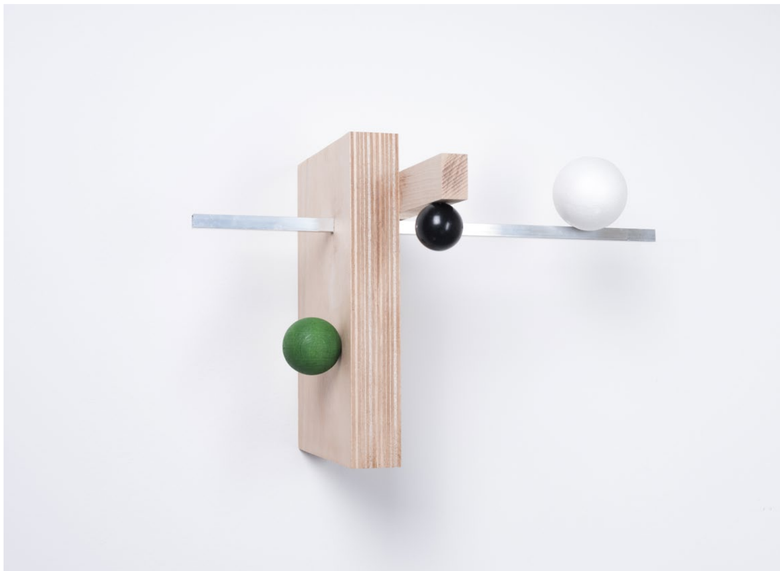
3 Axes / 3 Sphères , 2017 Wood, aluminum, granite, polystyrene. 45 x 29 x 31 cm