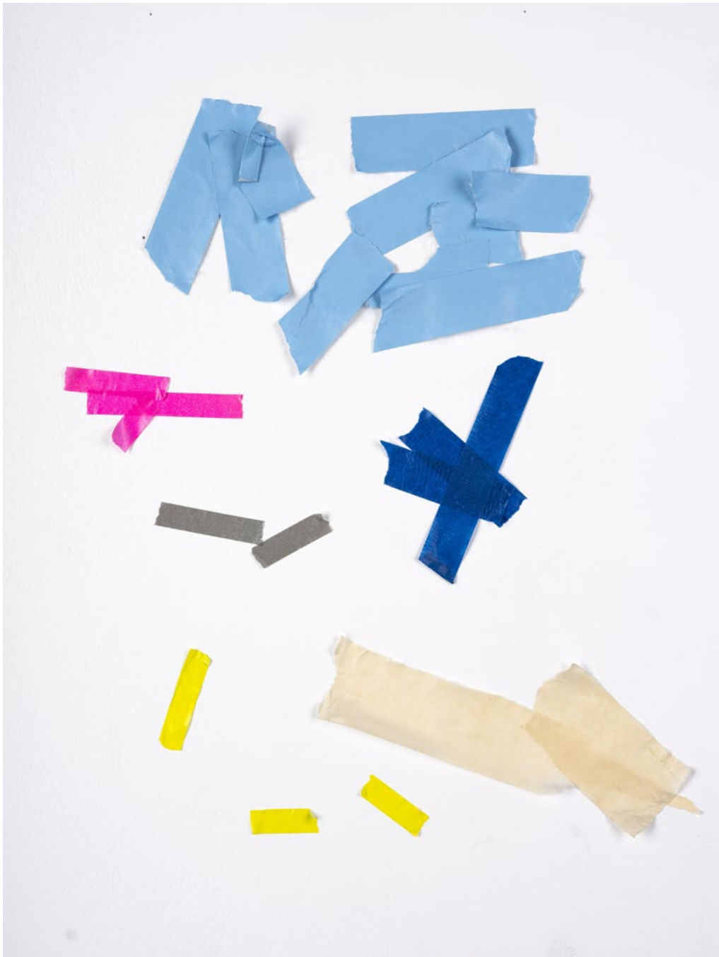
Untitled (Celo) , 2018 Digital print on 310 gr paper. 55 x 40 cm. Ed. 1/3