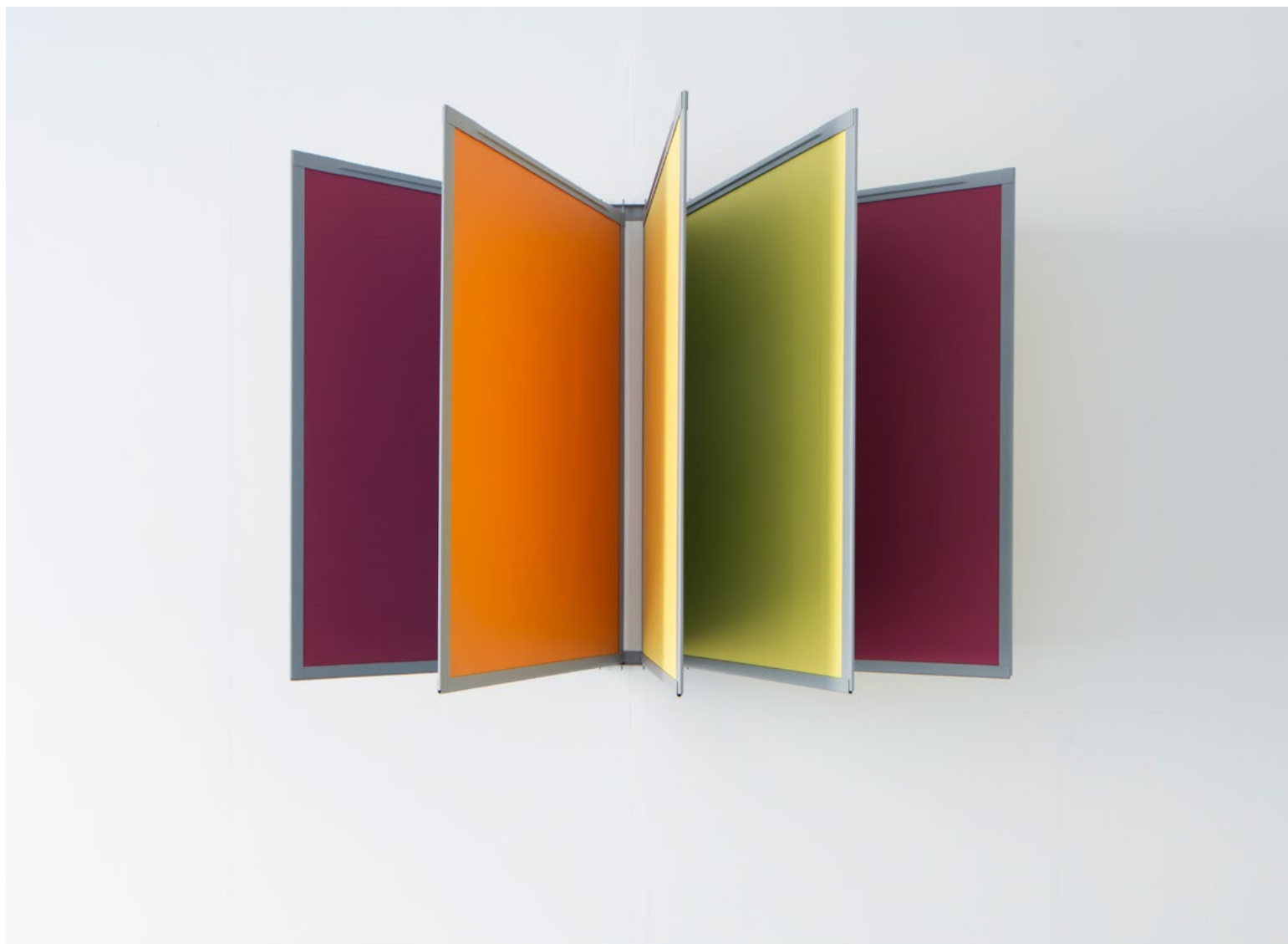
Untitled , 2018 Metal display, colored paper. 130 x 165 x 75 cm