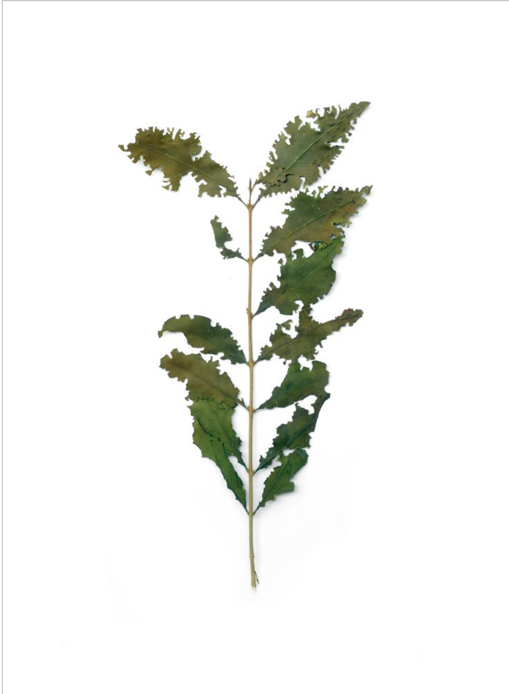
Untitled (Hoja) , 2018 Digital print on 310 gr paper. 40 x 30 cm. Ed. 1/3