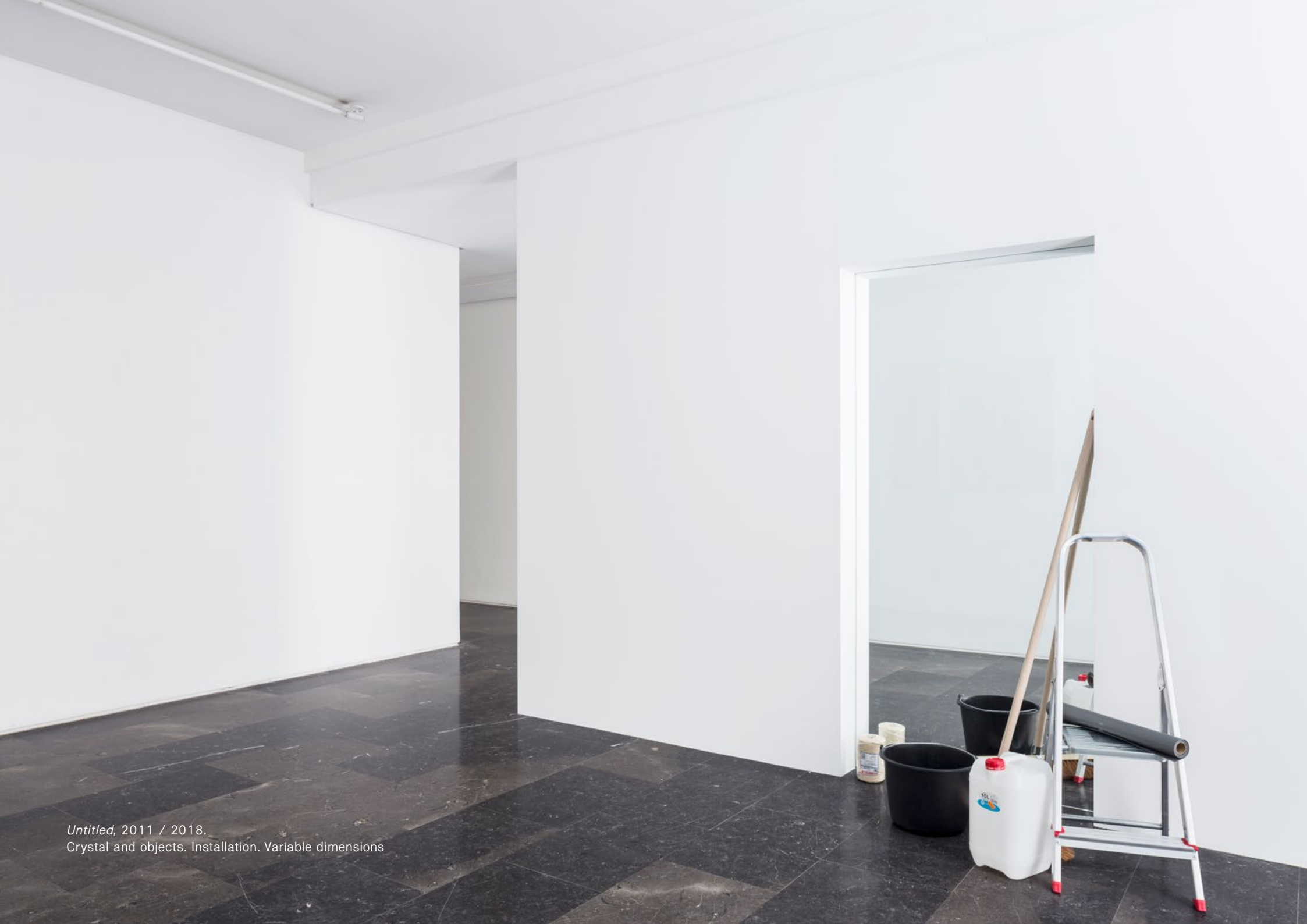
Untitled , 2011 / 2018. Crystal and objects. Installation. Variable dimensions