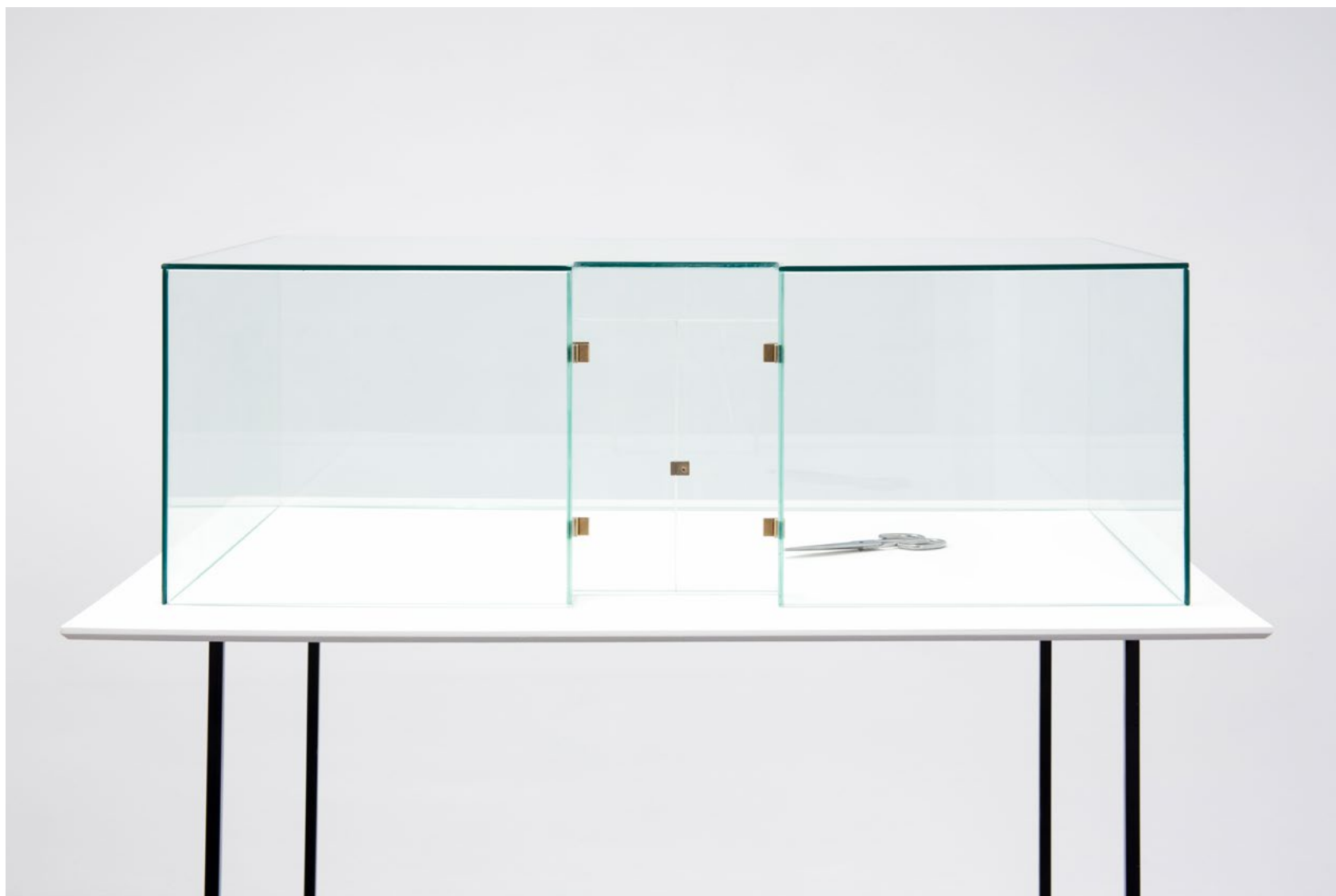
Untitled (Mini vitrina), 2015 Crystal and scissors. 109 x 96 x 75 cm