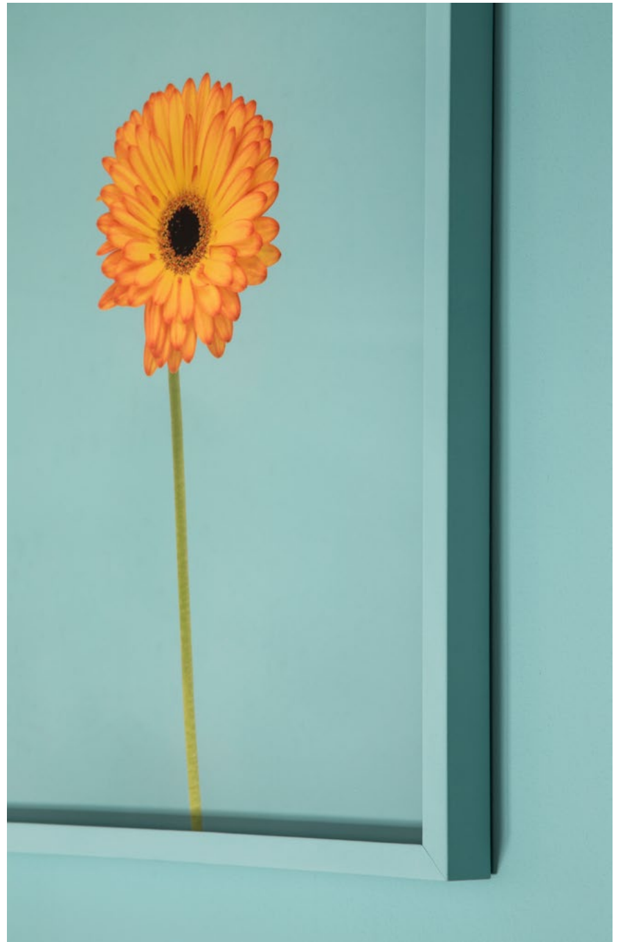
Untitled (Flor) , 2018. Digital print on 310 gr paper. 73 x 55 cm. Ed. 1/3